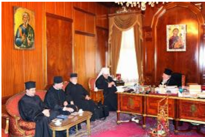
Ukrainian Orthodox Church delegation meets His All Holiness Ecumenical Patriarch Bartholomew in his office at the Ecumenical Patriarchate in Istanbul, Turkey.

With respect to the UOCC's relationship with the Ecumenical Patriarchate, the proposals advanced by the UOCC regarding the issue of the Title of Bishop of Toronto were discussed at length. Major progress was made to achieve a mutually acceptable resolution that will be addressed by the Sobor of the Ukrainian Orthodox Church of Canada to be held in July 2015.