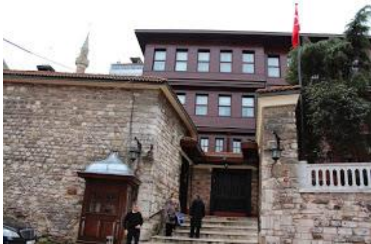
Administrative centre of the Ecumenical Patriarchate of Constantinople in Istanbul, Turkey

The meeting discussed the three broad issues raised by the UOCC: The UOCC's relationship with the Ecumenical Patriarchate, the UOCC's vision and mission in Canada and the UOCC's desire for an ecclesiastical resolution by the Patriarch of Constantinople to recognize Ukraine's unrecognized Ukrainian Orthodox Churches.