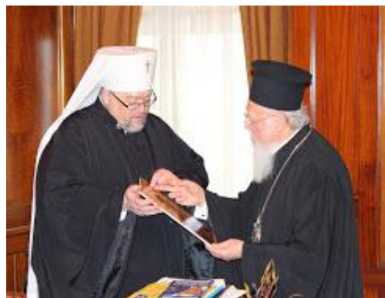
Presentation of gifts between His All Holiness Ecumenical Patriarch Bartholomew and His Eminence Metropolitan Yuriy.

UOCC to assist the Ecumenical Patriarchate in continuing to facilitate a resolution to the crisis of church unity in Ukraine and to continue to promote Orthodox unity in the world.